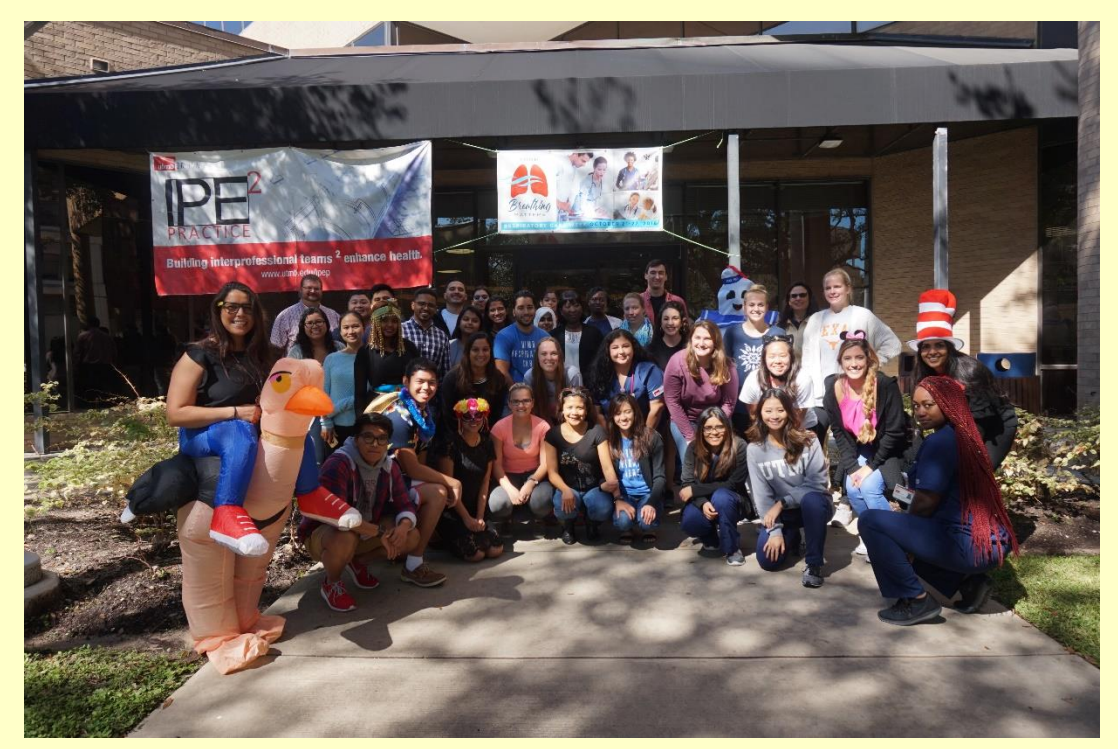
Above RC week student and faculty group photo under the AARC banner in front of the School of Health Professions.